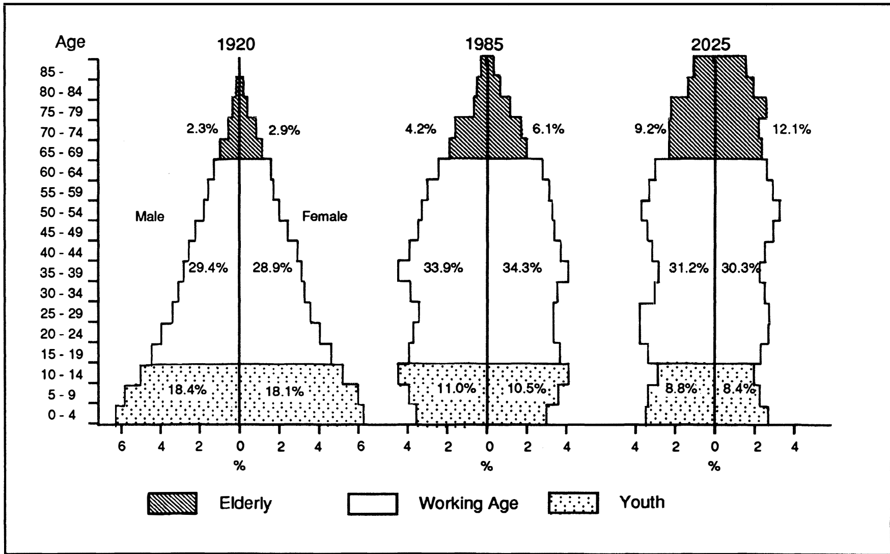
Figure 8.2. The population pyramid of Japan.